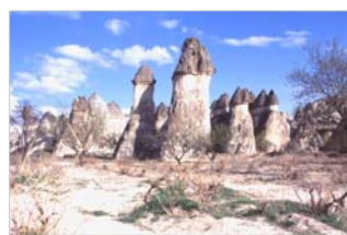
Fairy Chimneys, Cappadocia

It's quite possible weird and wonderful Cappadocia hosts fairies and other whimsical creatures so we'll stop by to