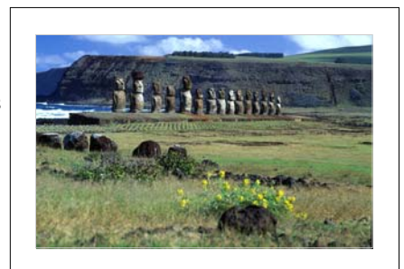
Easter Island's Mysterious Moai

Despite its sub-tropical spot Easter Island is strangely void of trees and vegetation—the land was cleared generations ago by islanders obsessed with appeasing the gods.