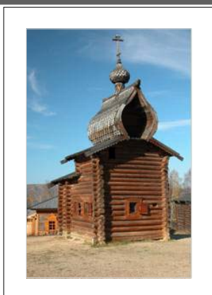
Wooden Architecture Museum Irkutsk, Siberia

6 September - Turkey tour departs; 22 days, $6,875 + Greek Islands wind- down option (see overleaf).